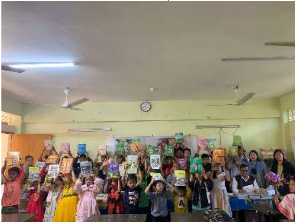
Book Festival at Moanoghar School