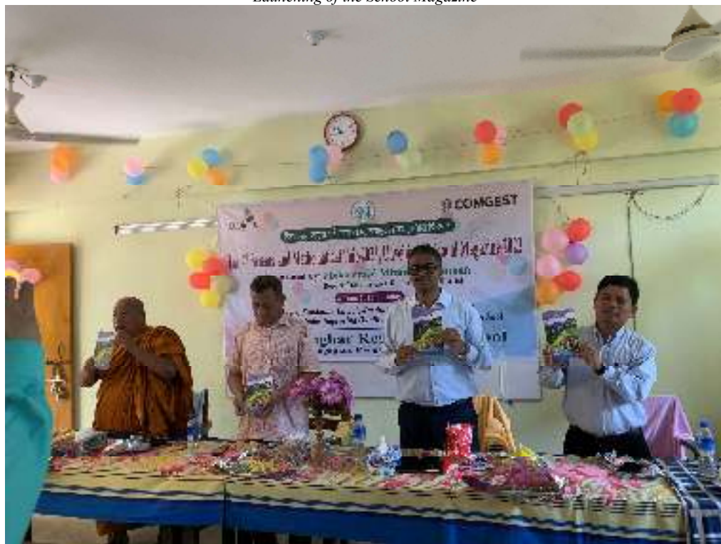
Launching of the School Magazine