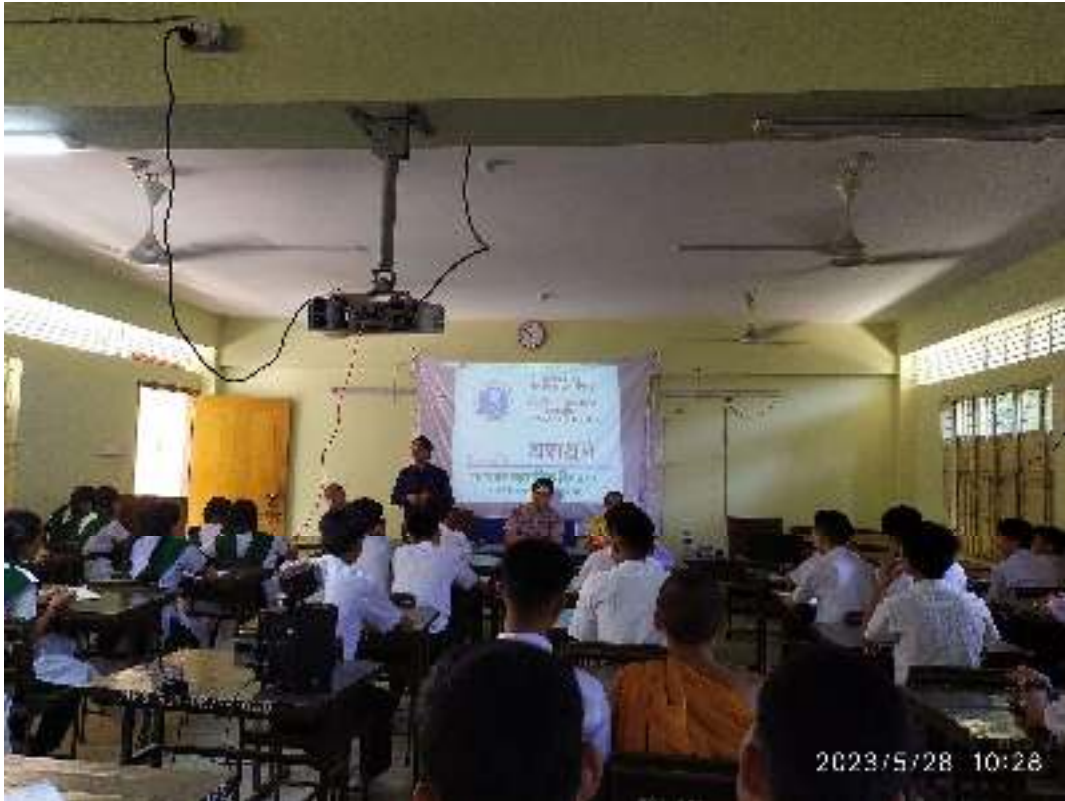
Celebration of the Julio Curie Peace Award by Bangabandhu Sheikh Mujibar Rahman (23 May 2023)