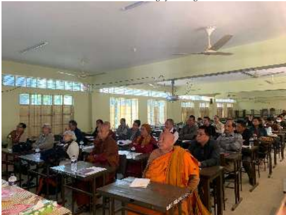
Annual General Meeting of Moanoghar