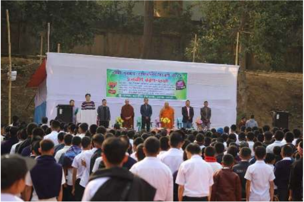
Annual Sports Day of Moanoghar School