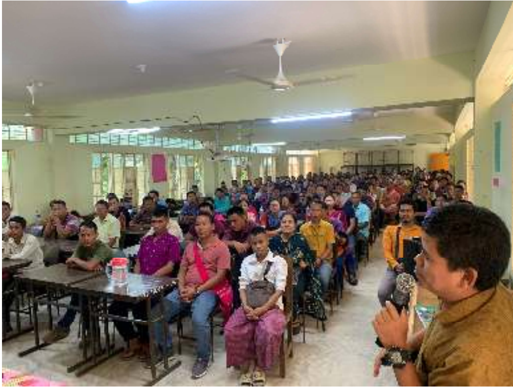
Parents/guardians meeting (9 September 2023)