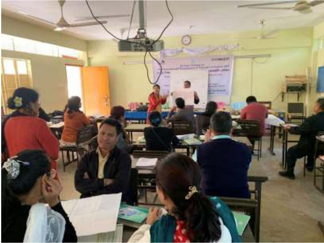
In-house Teachers' Training at Moanoghar School