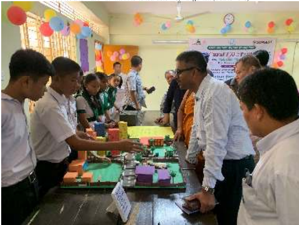
Science and Math Fair with the honourable DC, Rangamati (4 June 2023)