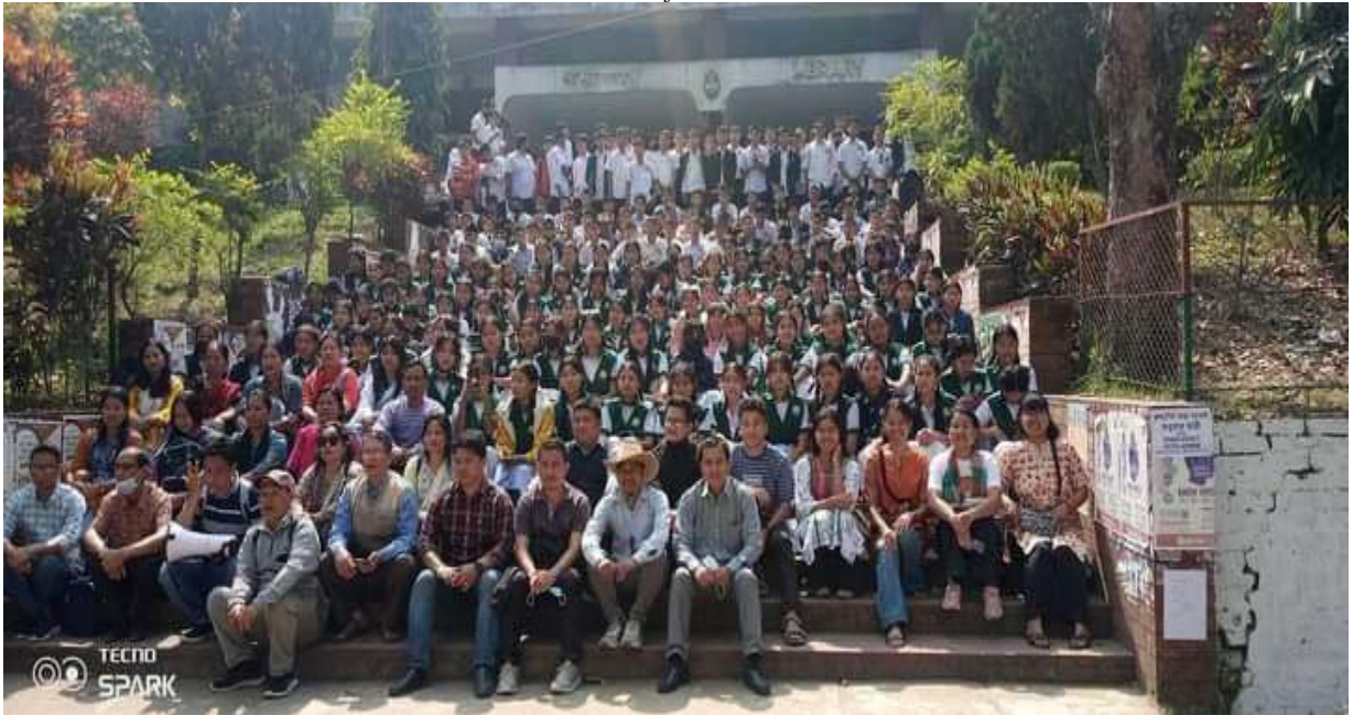
Education Tour of Class 10 students