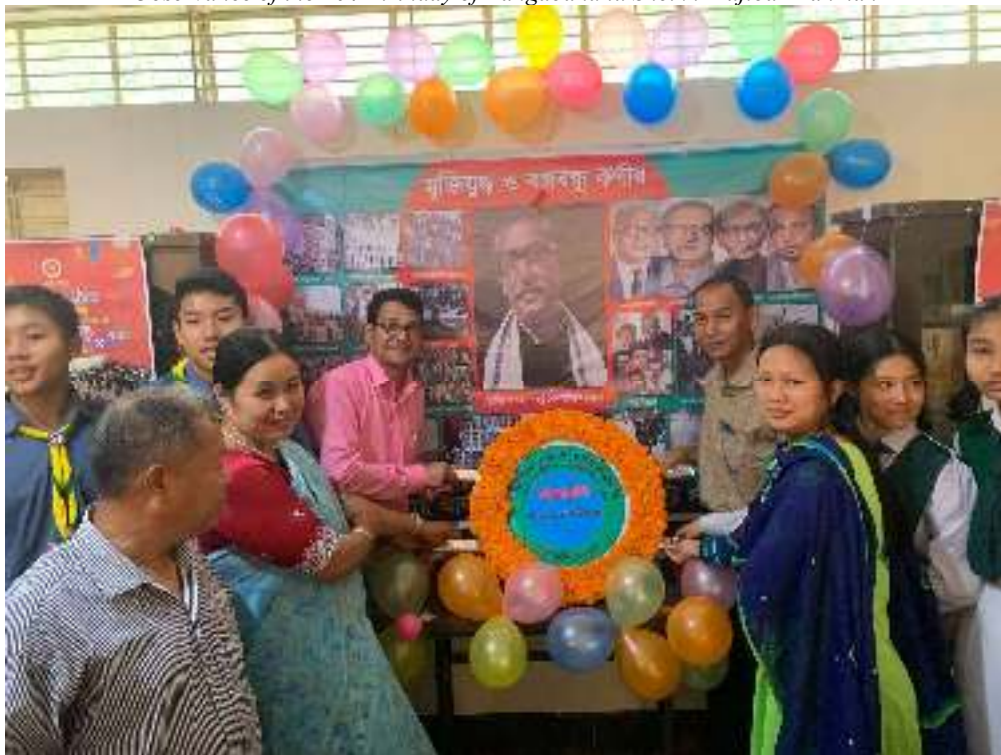
Observance of the 104 Birthday of Bangabandhu Sheikh Mujibar Rahman