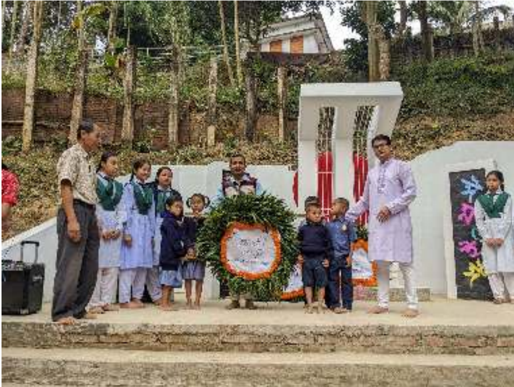
Offering of floral wreath to the martyrs on International Mother Language Day