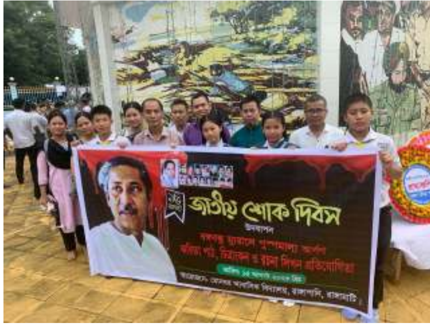
Moanoghar and School offering homage to the Father of the Nation on 15 August