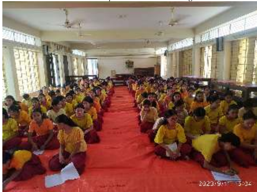
Orientation session on reproductive health with the girl children

Moanoghar was founded in 1974 with the ideals of imparting education to the poor and orphan children from the indigenous ethnic minority communities in the greater Chittagong Hill Tracts. Moanoghar will celebrate these august moments with due solemnity over two days on next 20-21 December 2024. The decision was formally taken in a joint meeting of the Moanoghar executive committee and the Moanogharians on 29 September 2023. A special documentary will be prepared for this occasion as well as publication of a commemorative volume. The volume will contain memoirs and reminiscences of the founders, Moanogharians and former staffs and teachers, along with articles and research essays on education, child development and care, cultural traditions and society of the CT communities.