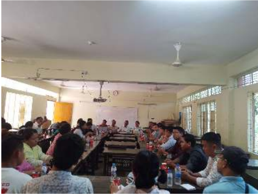
Moanoghar 50 year anniversary preparation meeting