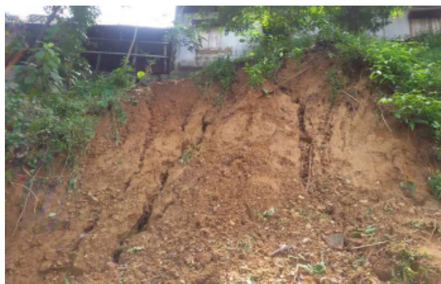
Moanoghar dining hall and kitchen