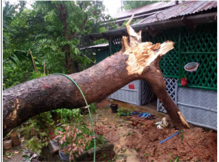
Damages by Clyclone Mora at Moanoghar