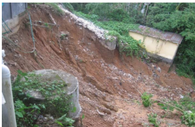
A section of Moanoghar campus

At the time of drafting this news bulletin (end-August 2017), many families have moved from the shelters; to their original homes or with relatives. However, about 60 families still continue to live in the Meditation Centre.