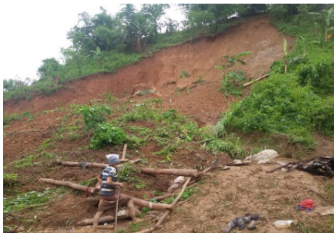
House of a Moanoghar staff After landslides