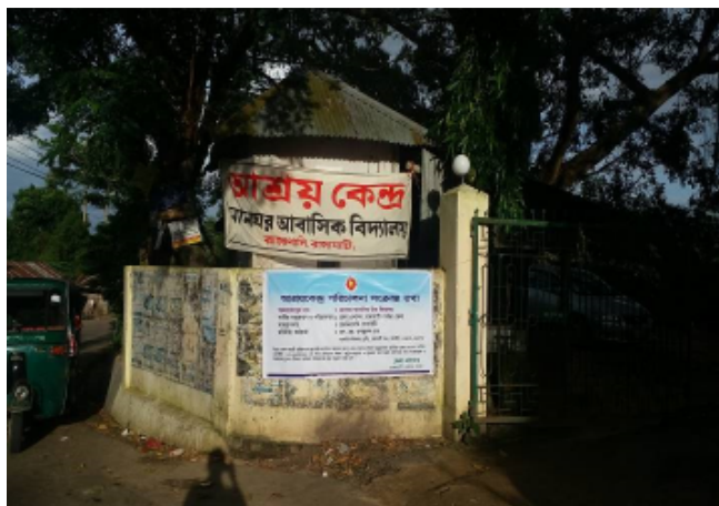
Victim shelter centre at Moanoghar School