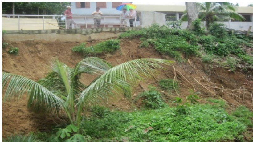
Landslides in the School Area at Moanoghar