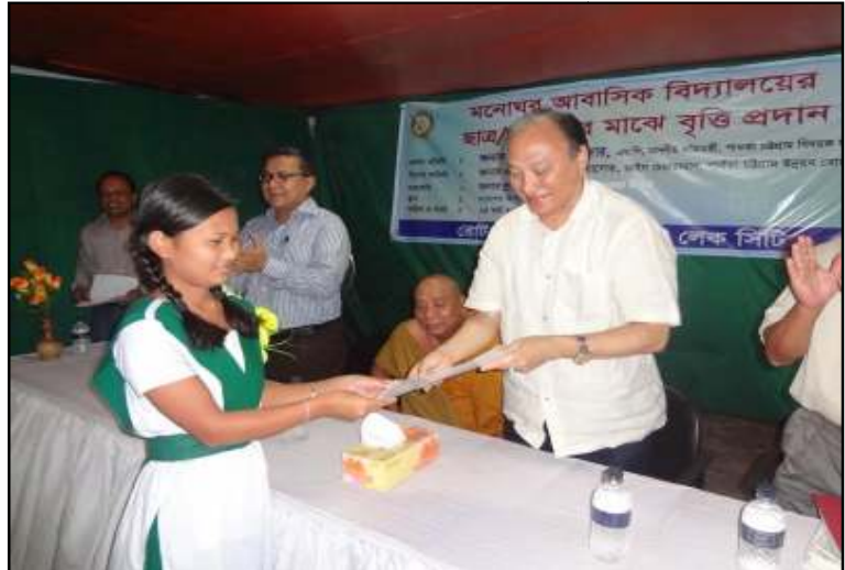
Dipankar Talukder, Hon'ble State Minister, Ministry of CHT Affairs in Moanoghar (see next page)