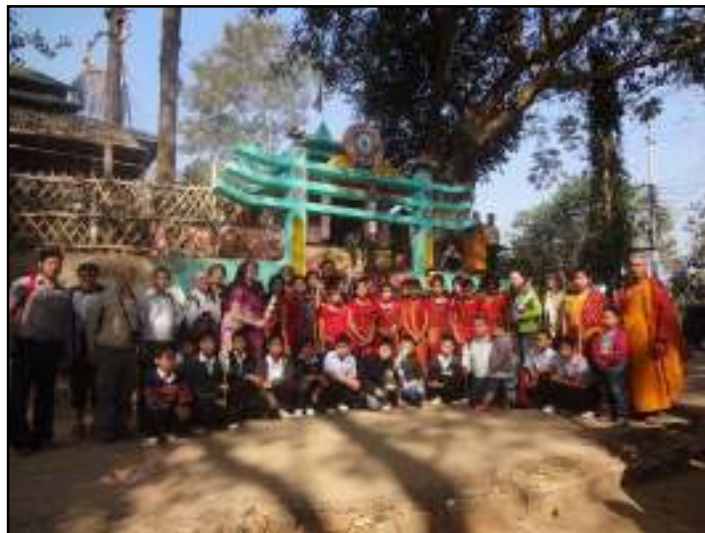
The delegation from AJHA, France at Moanoghar

At the meeting both parties - Moanoghar and Ajha discussed the progress of the children's sponsorship program. Also discussed about strengthening of mutual cooperation and increasing of the number of sponsored children in the next five year. Ajha agreed to increase the number of students for sponsorship program and asked Moanoghar to submit a proposal for the next five years. Besides, Ajha also expressed interest to additional funding for maintenance of hostels and ambulance, and afforestation program on Moanoghar campus.